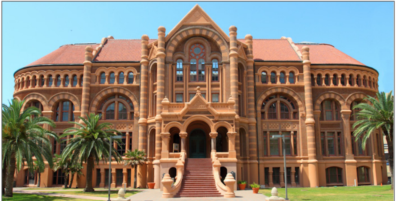
“Old Red” at UTMB Galveston, Texas

Sponsorship packages have been designed to facilitate maximum visibility at the conference and, in many cases, feature opportunities to be promoted before and after the event.